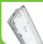
Wet Location Series