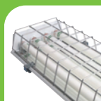
Power Cage Series