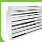
Power Bay Series