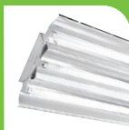
Power Strip Series